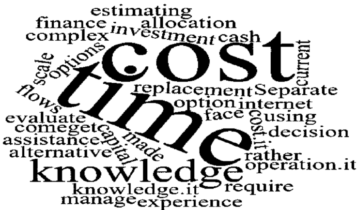
Fig. 2 WordCloud illustration for disregarding capital budgeting techniques.

Data from each SME that disregarded capital budgeting techniques was noted to be less than one-third of the total sample size. The aim of the study was to obtain the keywords to explore the reasons for not adopting capital budgeting techniques. All these issues have been identified based on the response obtained from the SMEs. Wordcloud was applied to the set of responses in order to observe which highlighted keywords (Fig. 2). As noted in the Wordcloud illustration, cost, time and the knowledge are the perceived barriers to use capital budgeting techniques; this explanation was based on the relative size of barriers as depicted in the Wordcloud, depending on their relative frequency. These were expressively displayed in respondents' discourses. Based on these keywords, it can be inferred that the main three concepts relate to the driving forces for SMEs to disregard capital budgeting techniques are cost, time and knowledge. These reasons are guided by limited evidence in previous studies conducted by Gupta and Jain (2016), and Silvola (2006) who found that financing issues, budgetary issues and absence of skills as key constraints to disregard using of capital budgeting techniques.