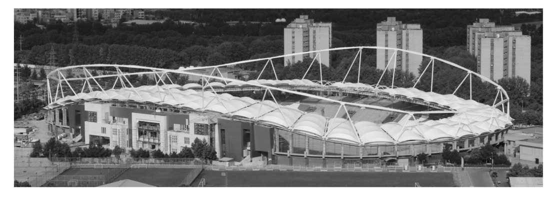
Fig. 2. Imam Reza Stadium in May 2015.

L. Scaringella, F. Burtschell / Technological Forecasting & Social Change xxx (2015) xxx-xxx