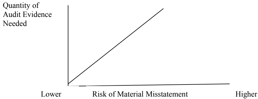
Fig.1 Relationship of Risk of Material Misstatement to Sufficiency (Quantity) of Audit Evidence Required

The figure 2 shows that the quantity of audit evidence required decreases, if the quality (appropriateness) of audit evidence obtained increases. Thus, the concepts of sufficiency and appropriateness of audit evidence are interrelated.