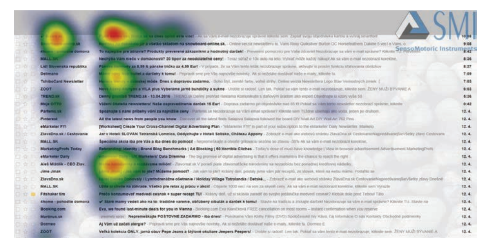
Fig. 2. User testing of e-mail subject with eyetracking technology [4]

(Area of Interest) functions. The KPI function split e-mails into sectors with the listing of the average time, the respondents spent on them [8]. The AOI function allowed splitting the email to basic architectural elements (header, head, introduction, top offer, body of the e-mail, end, foot, footer).